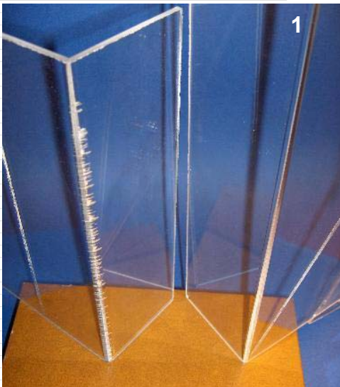
Photo 1: on the right, grooving and bending sheet of Altuglas® Essential.

On the left, standard CN PMMA sheet, after spraying with perfume diluent. After 3 months, there is still no crazing with Altuglas® Essential.